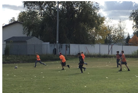
Orange Shirt Day