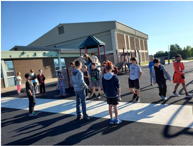
Recess Break - Greeting their friends in the other class