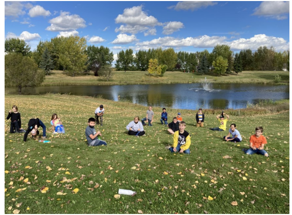
Terry Fox Walk/Run