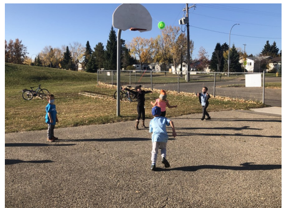
Basketball at Recess