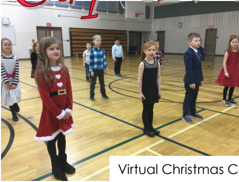
Virtual Christmas Concerts