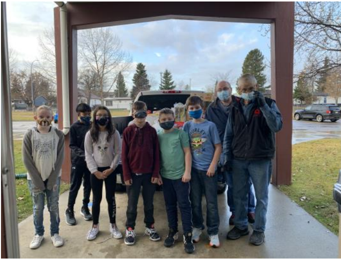
Some of Mrs. Schatz's grade 5 students helping load the Halloween food bank donations.