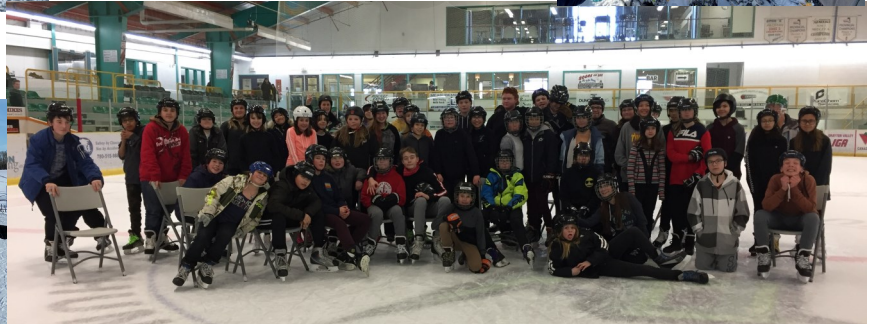
Grades 5, 7 & 8 Skating