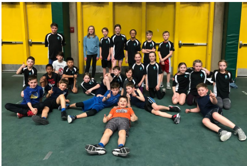
Running Room Indoor Games