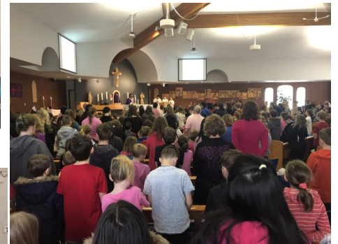
Ash Wednesday Liturgy