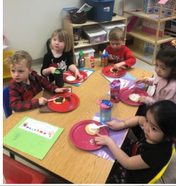
Preschool Valentine's Day fun