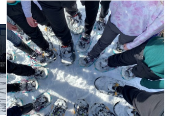
Snowshoeing on a beautiful day