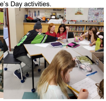
Thunder players join us for Valentine's Day activities.