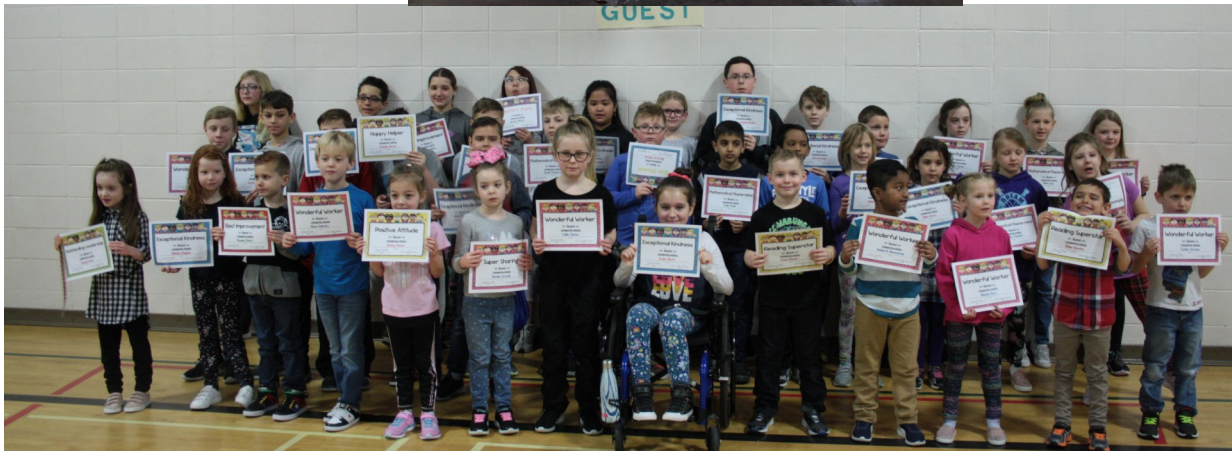
Congratulations to all our February Elementary Award recipients who received awards on February 28 th .