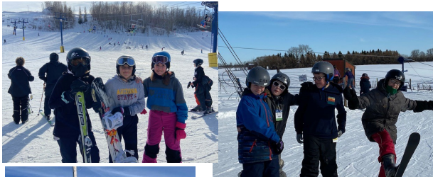
Grade 7 Ski Trip to Rabbit Hill