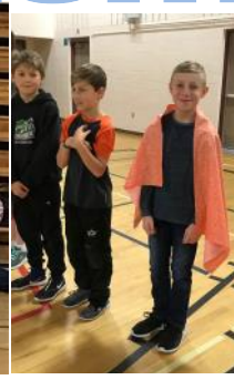
Orange Shirt Day