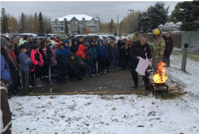
Grade 5 Fires Safety presentation