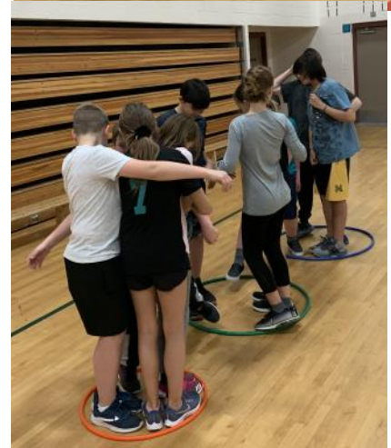
7A PE team building