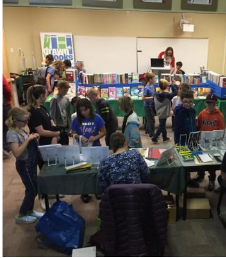
Comic Book Fair