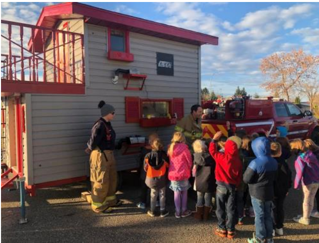
Grade 1 Smoke Detector presentation