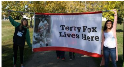
Terry Fox Walk