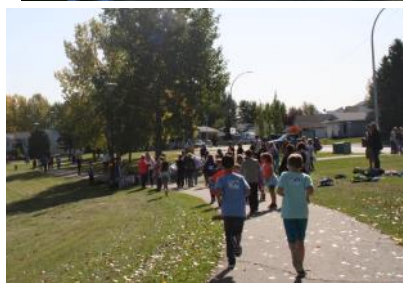
Orange Shirt Day