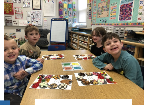
100th Day games