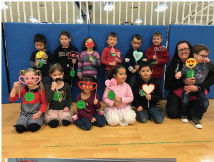
Preschool Valentine's Day fun