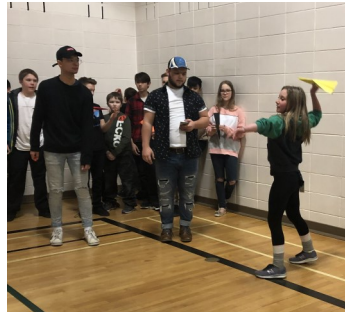
Grade 7 & 8 NET Retreat