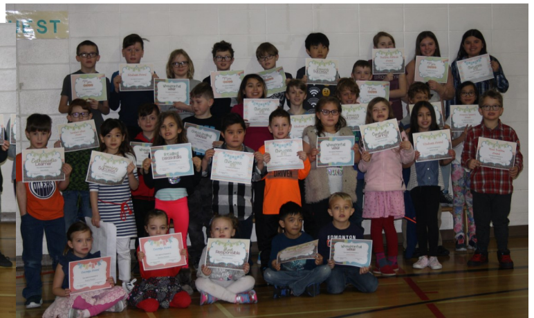
Congratulations to all our January & February Elementary Award recipients who received awards on February 28 th .