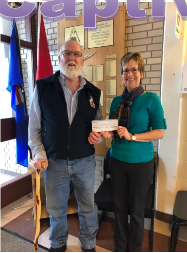
Our students would like to thank the Royal Canadian Legion Branch #269 for their donations to our snack/lunch program.